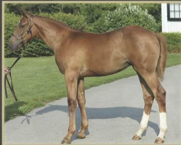
QUEST STAR BONITA SCF 2016 BWP CHESTNUT FILLY (BIG STAR-NABAB DE REVE-CHIN CHIN) NFS