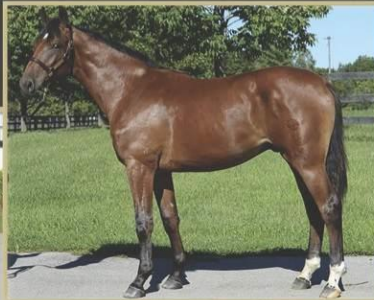
POP STAR SCF 2015 BWP BAY COLT (BIG STAR-DIKTATOR VD BOSLANDHOEVE -NABAB DE REVE) NFS