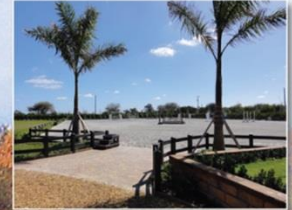
Design & Construction