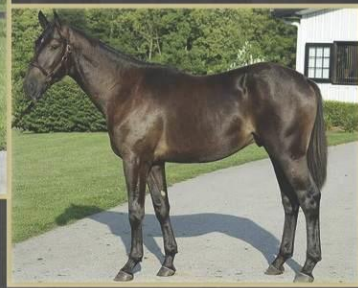
POLARIS SCF 2015 BWP DARK BAY COLT (BIG STAR-LESTER- VOLTAIRE) NFS